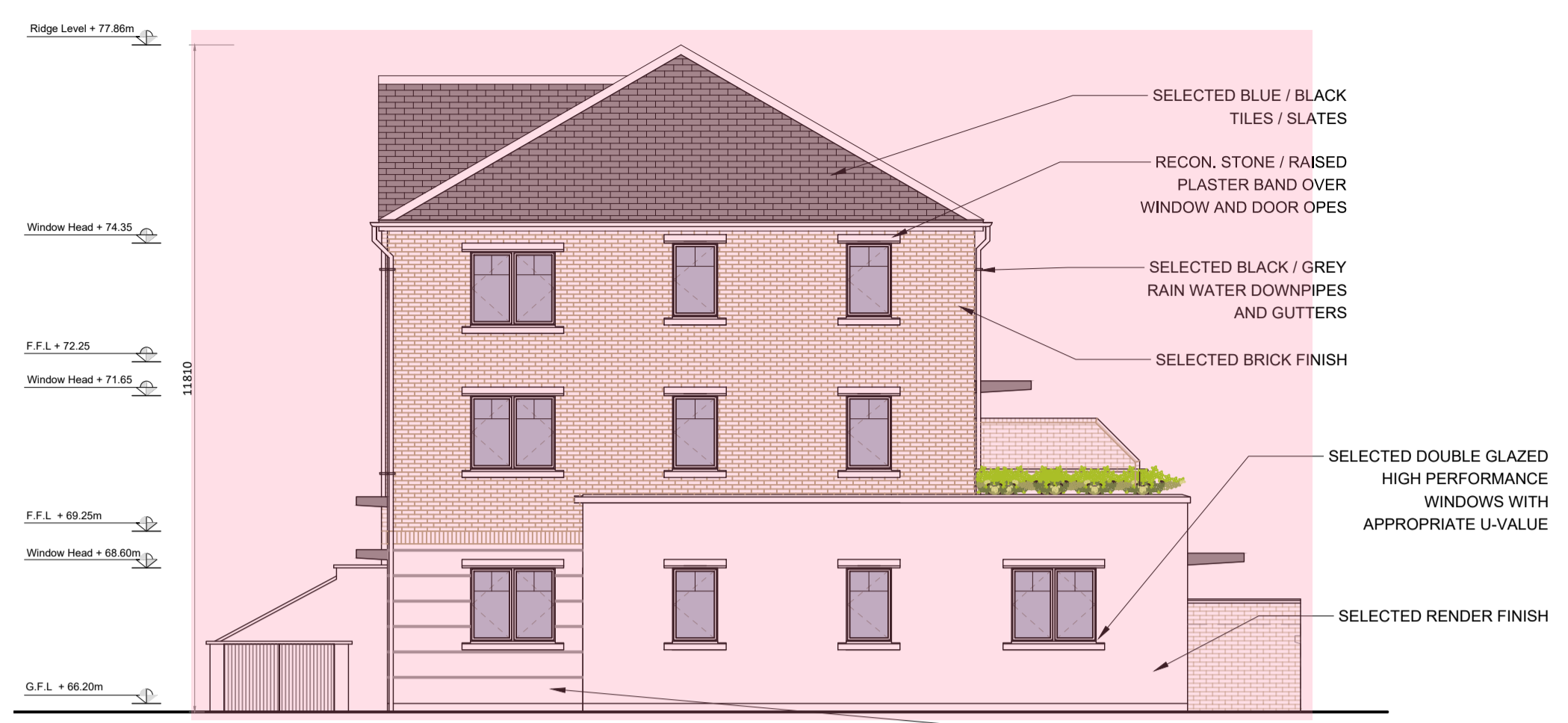
NORTH EAST ELEVATION - BLOCK B