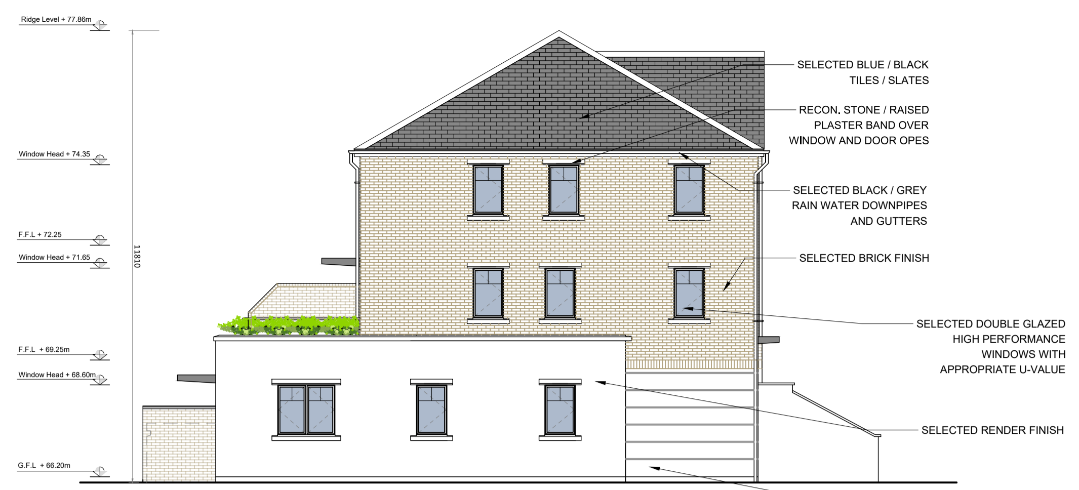
SOUTH WEST ELEVATION - BLOCK B